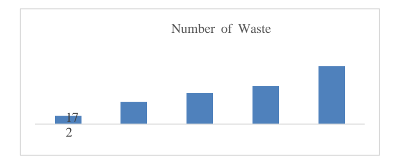
Graph 1. Number of Waste Banks in Indonesia (2018)

Based on Jambeck et al, (2015), Indonesia was ranked second in the world for producing plastic waste to the sea which reached 187.2 million tons after China which reached 262.9 million tons. This is related to data from the Ministry of Environment and Forestry (KLHK), which states that the plastic produced from 100 shops in one year reached 10.95 million pieces of plastic waste bags. This amount is equivalent to an area of 65.7 hectares of plastic bags or about 60 times the size of a football field. That's just plastic waste, not including garbage or other solid waste, there is also liquid waste, and gas waste. If you pay attention, the amount of waste in several provinces in Indonesia continues to increase from year to year. For example, in 2000 the amount of waste in West Java was around 10 million tons and in 2016 the transportation of waste reached 300 tons per day (KLHK, 2016).