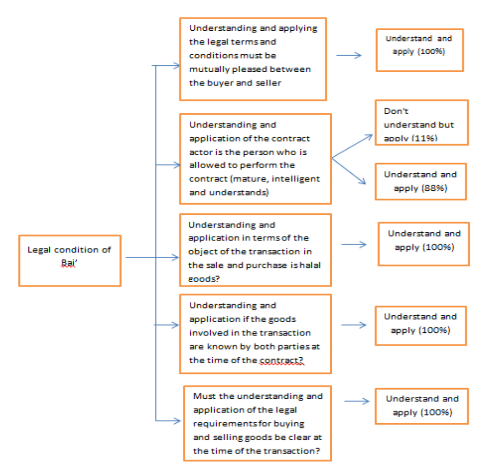
Figure 2. Legal Bai' Term