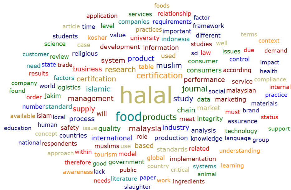
Figure 3: Atlas.ti word cloud

Using atlas.ti, the most keywords appear is depicted by the following graph: