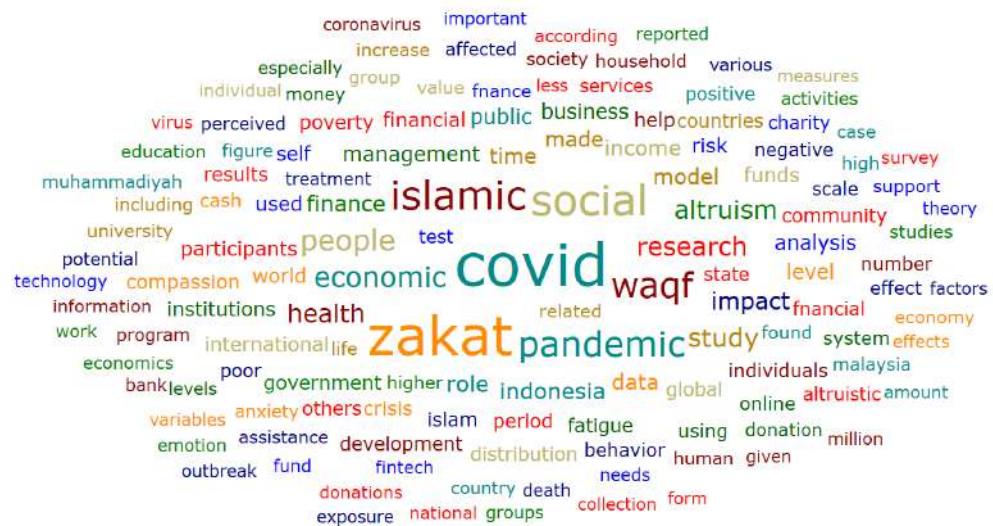
Fig. 3. Atlas.ti Word cloud

The word cloud resulted from the full texts of the articles is depicted by the following figure: