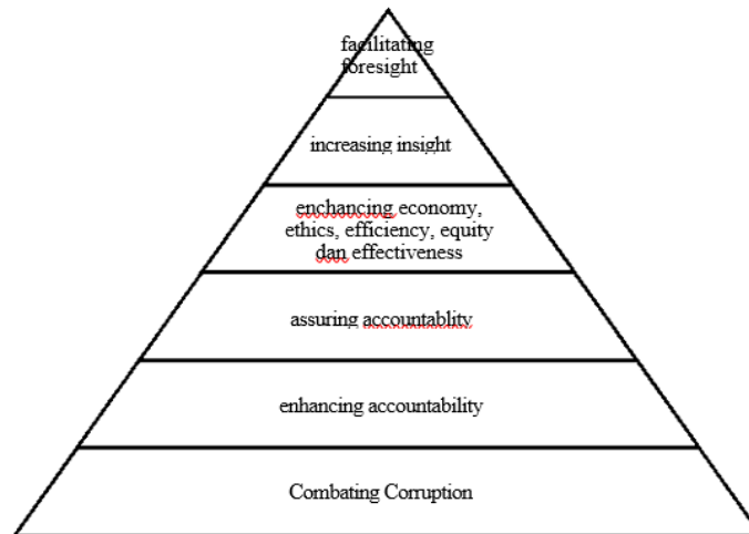
Figure 1: Maturity Accountability Model of INTOSAI