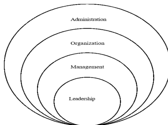
Figure 2: Relation Model of Management, Organization and Administration