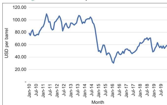
Figure 3: WTI crude oil price chart for 2010-2019